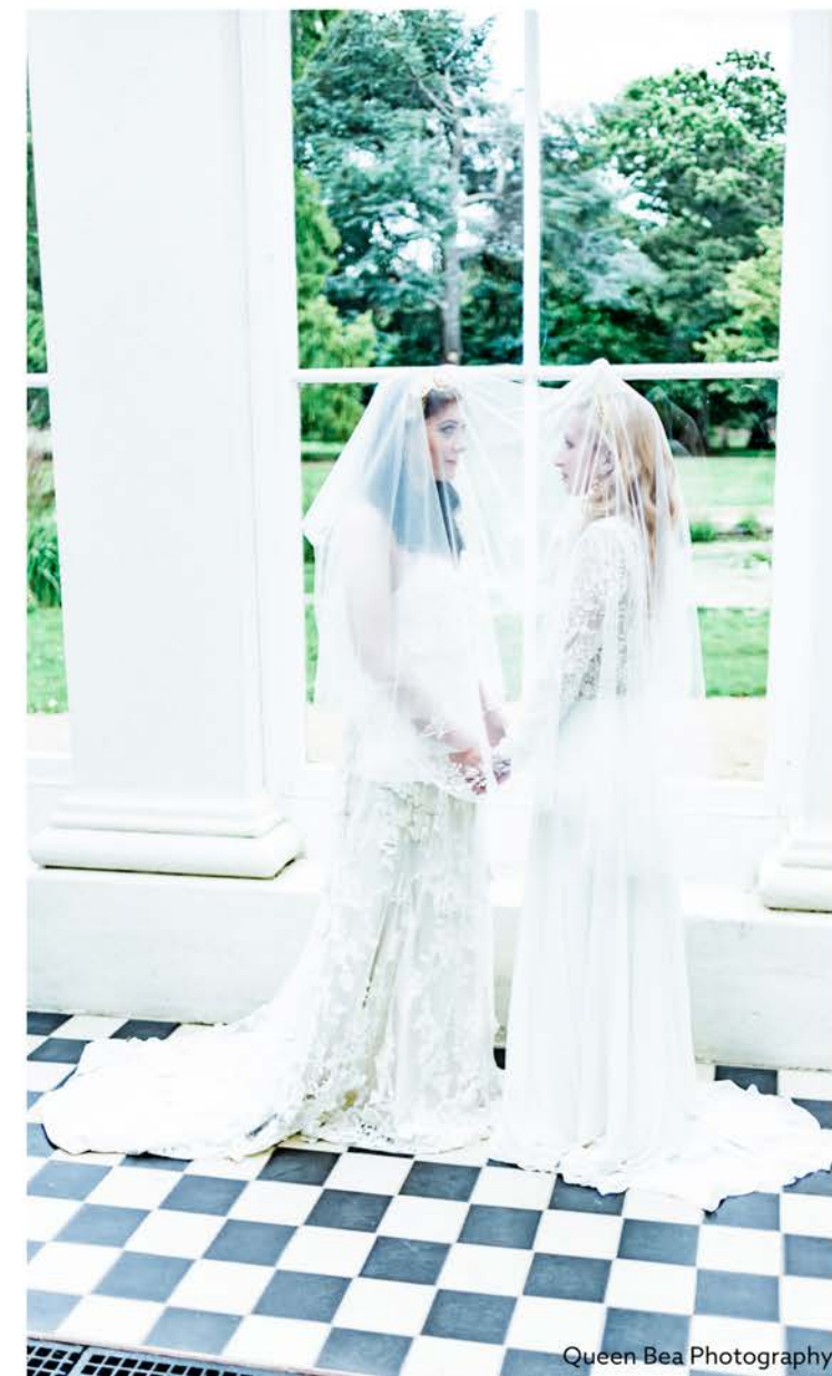
Queen Bea Photography

Prices are applicable for events held before the end of March 2023.