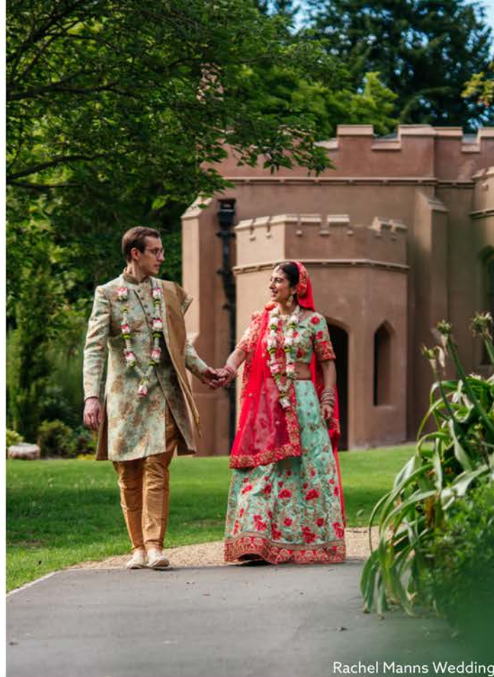
Rachel Manns Weddings