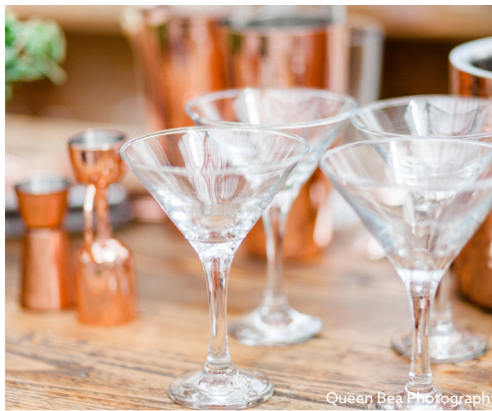
Queen Bea Photography