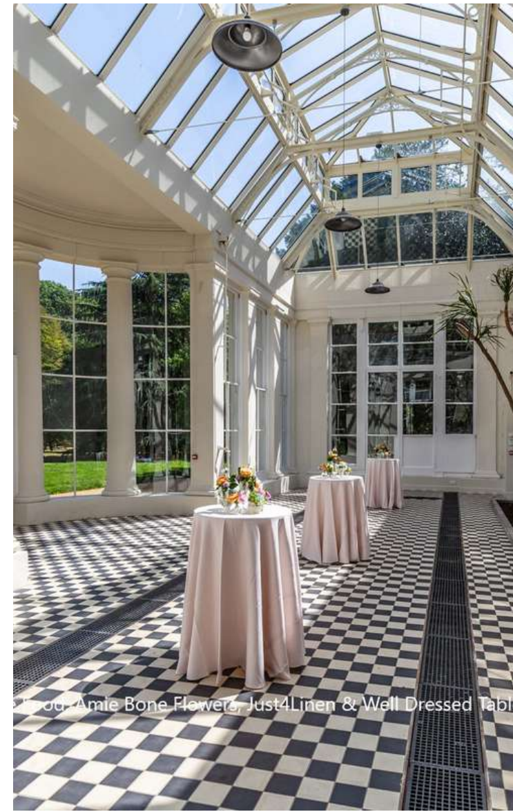
Food: Amie Bone Flowers, Just4Linen & Well Dressed Table

Theatre style: 80 Seated Dinner: 80 Drinks reception: 80