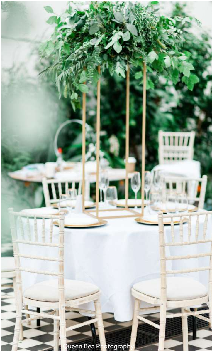
Queen Bea Photography