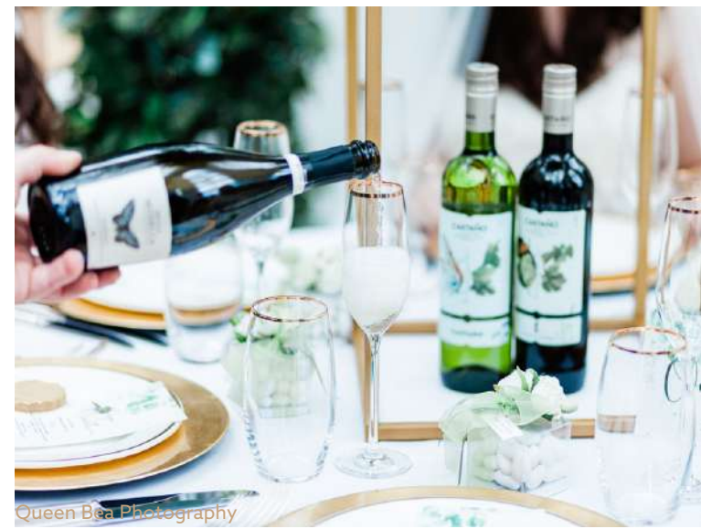
Queen Bea Photography