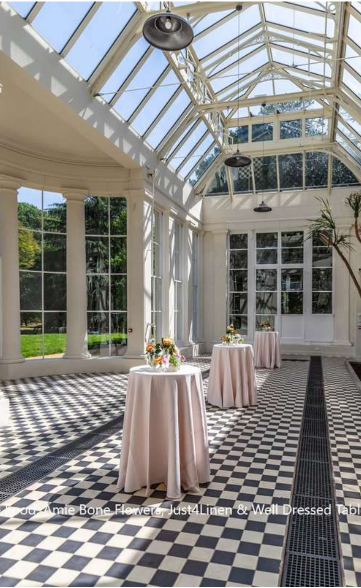
Food: Amie Bone Flowers, Just4Linen & Well Dressed Table

Theatre style: 80 Seated Dinner: 80 Drinks reception: 80