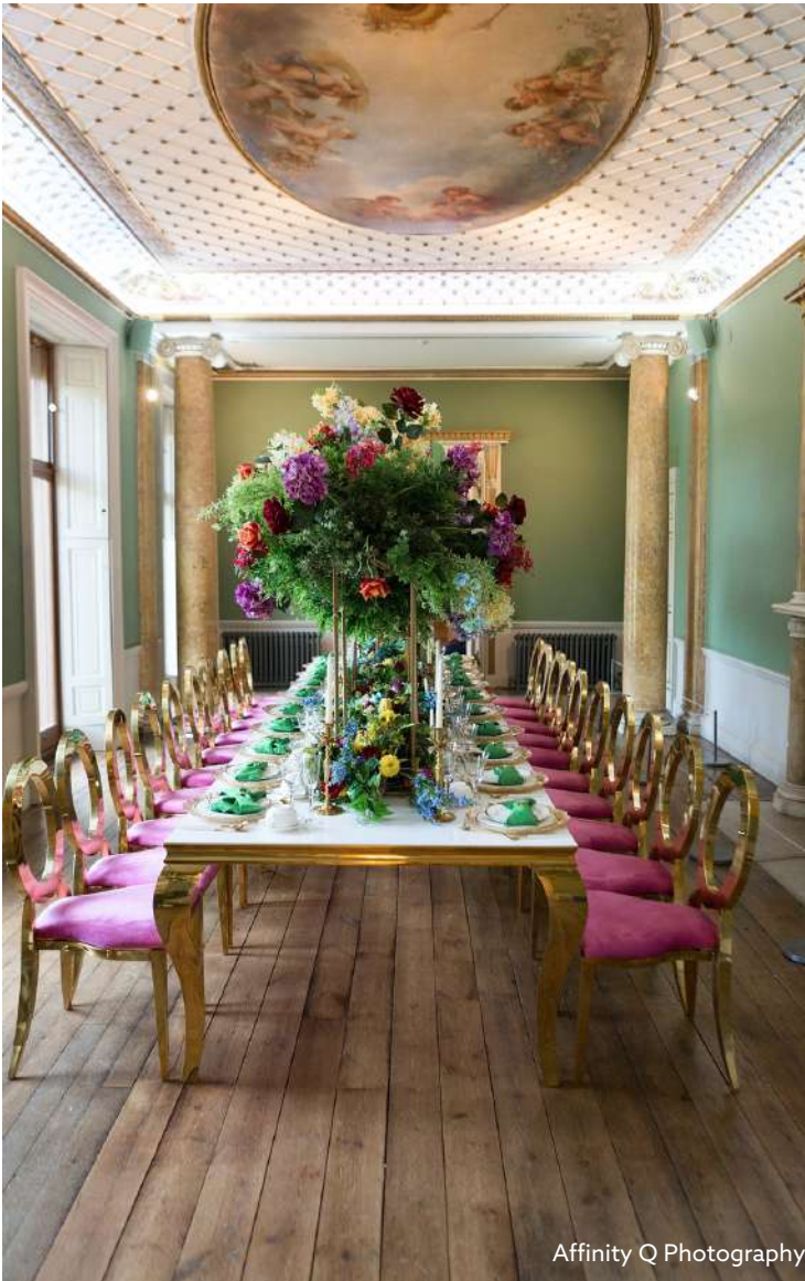
Affinity Q Photography